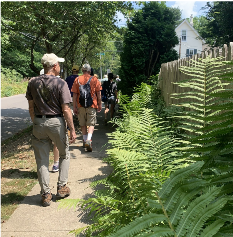
Fern Walk - Willow Grove Avenue - Chestnut Hill - Philadelphia