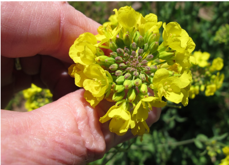
BRASSICACEAE Brassica rapa Field Mustard Fagleysville and Evans Rds. Mont. Co. 4/10/2023

John describes his preserve in this way: "The property is crossed by numerous trails that visit the different micro climates. With the loss of many ash trees, we are now expanding the areas exposed to more sunlight. One notable thing is the continuing effort to rescue areas from the big three: stilt grass, multiflora rose