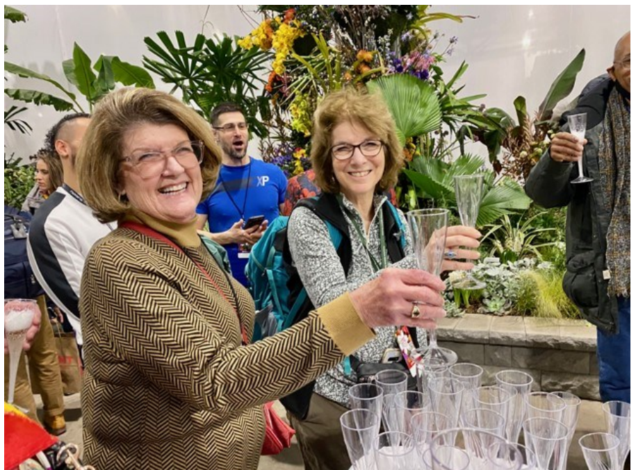
4 First-timers Delaware African Violet & Gesneriad Society members at the Flower Show